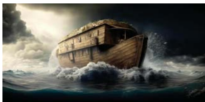
FRONT COVER: Noah's Ark in the Midst of the Great Flood. The Ark is a symbol of the Catholic Church as the Ark of Salvation.