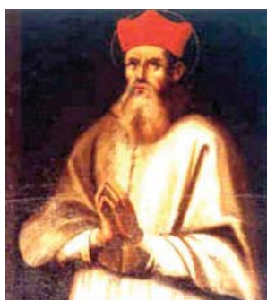
St. Peter Damian (+1072)

For the Preservation of the Free Exercise of the Latin Mass in the Life of the Church