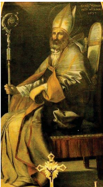
St. Gregory the Wonderworker, +270 A.D., Bishop of Neocaesarea and one of the Patristic Fathers of the Church. His prayer of petition to God actually moved a mountain which was impeding the construction of a church.